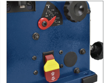
DEPTH SCALE AND SAFETY ON/OFF SWITCH