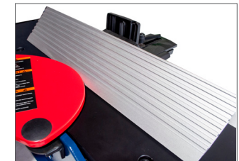
LARGE FENCE 19-3/4" x 4-3/8" TILTS 90° TO 135°